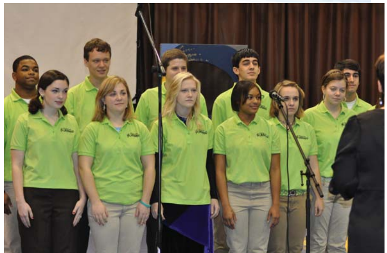
Alter celebrates it's first Fine Arts Assembly