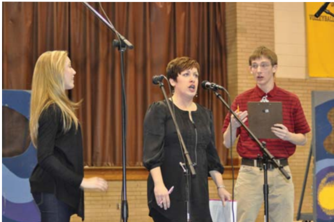
Alter celebrates it's first Fine Arts Assembly